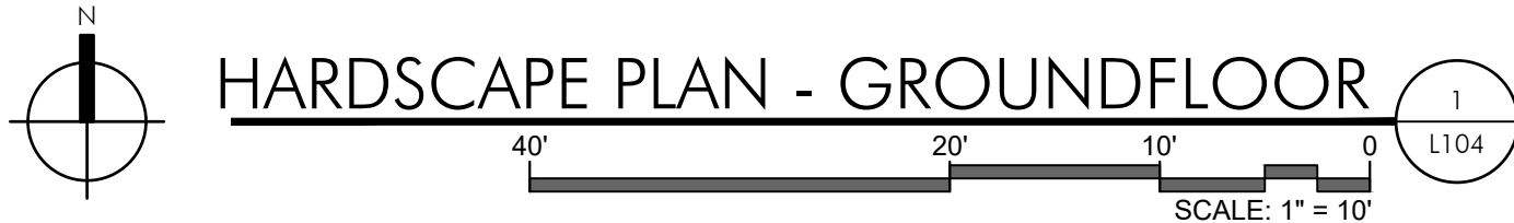
HARDSCAPE PLAN - GROUND FLOOR